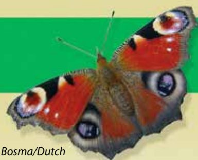
Peacock