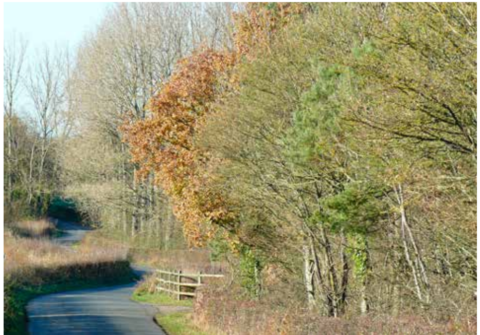
BBS/WCBS square near Hinxhill, Kent (Heather Silk)

typical farmland seemed an excellent concept because this includes so much of our countryside where there is not any targeted wildlife management. I soon found pockets of butterflies in small areas which had been left because of inaccessibility, as it was too damp or was game cover.