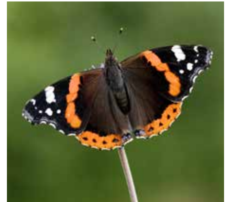
Red Admiral was more widespread increasing by 19 percentage points on 2015 levels. (Iain H Leach)

Of the three regular migrants, the Red Admiral was more widespread than from 2013-2015 and increased by 19 percentage points over 2015. This was a welcome recovery from 2015 when this species suffered the greatest decline in occupancy of all species recorded being seen in 18% fewer squares than in 2014. In TQ1608 (West Sussex), 33 individuals were seen on 19 July 2016. The highest WCBS count of this species here previously was six on 25 July 2011. Red Admiral was more widespread in all countries (on average 21 percentage