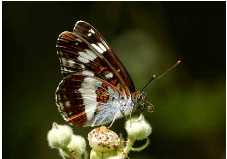
White Admiral (Iain H Leach)

The square is very varied, including part of a shooting estate, mixed woodland, intensive farmland, rural roads, hedgerows and ponds. Regularly monitoring butterfly populations on