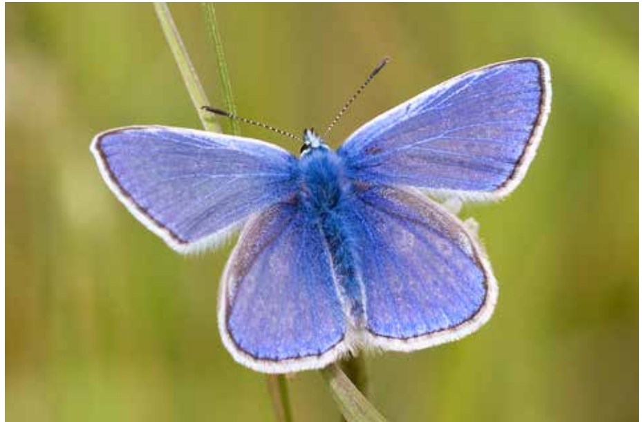
Common Blue was less widespread decreasing 16 percentage points on 2015 levels.

Peacock, Small Copper and Silver-washed Fritillary on the other hand were less widespread than in any other year of the WCBS. Across the UK, Peacock was down by 11 percentage points but this varied county by county. Despite being less widespread than any other year of