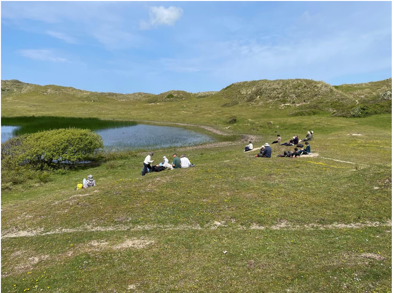
Lunch stop overlooking a Dune Slack

Firstly, huge thanks to Cornwall Wildlife Trust and especially Jon for allowing us access to this very special nature reserve, and secondly thank you for some wonderful weather to best enjoy.