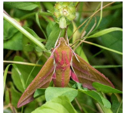
Elephant Hawk Moth